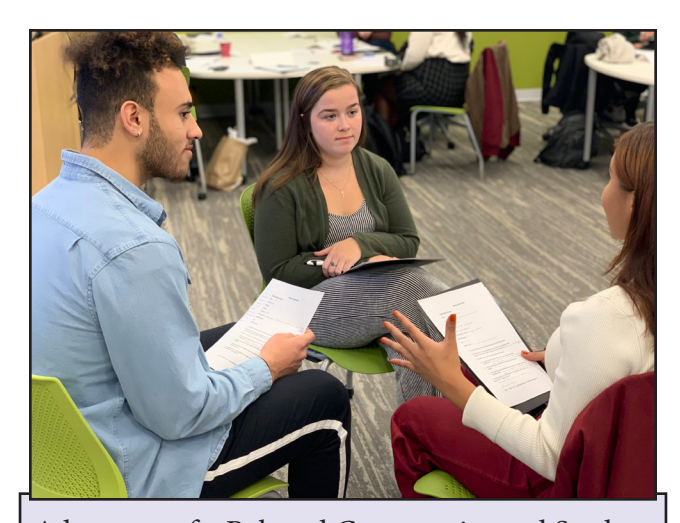
Advocates of a Beloved Community and Student Diversity Advisory Council's Launch