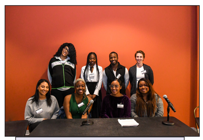
Intersectionality Panel at the 25th Anniverary Celebration Women's and Gender Studies